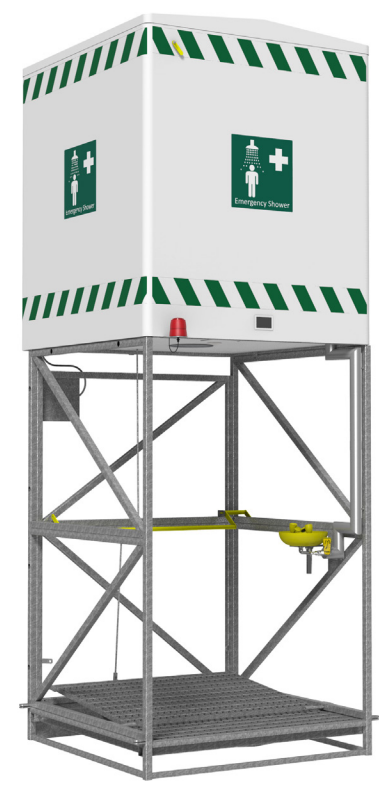
NOTE: 1. All dimensions are in millimeters unless otherwise specified and are subject to change without notice.