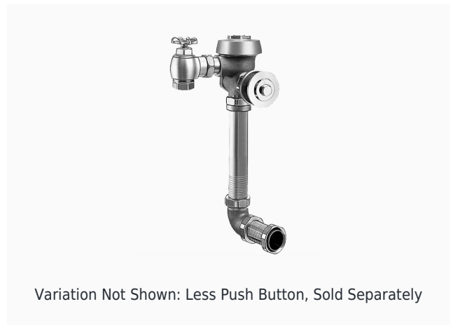
Variation Not Shown: Less Push Button, Sold Separately