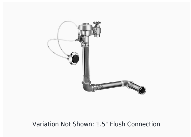
Variation Not Shown: 1.5" Flush Connection