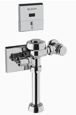
Variation Not Shown: Brushed Stainless