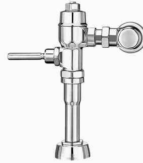
Variation Not Shown: Less Vacuum Breaker