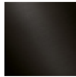
Dark Platinum matte 83 500 780-99

More custom finish options are available via special production (xTra Service). Please see our finish matrix for availability and pricing or contact a Dornbracht representative.