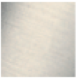
platinum matte 83 500 780-06