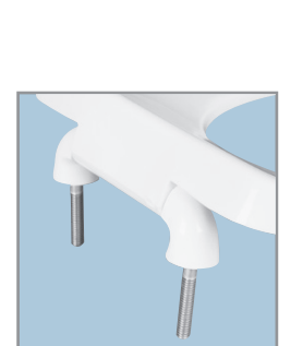
PLASTIC HINGES WITH STAINLESS STEEL POSTS AND PINTLES

Non-Corrosive 300 Series Stainless Steel Posts and Pintles